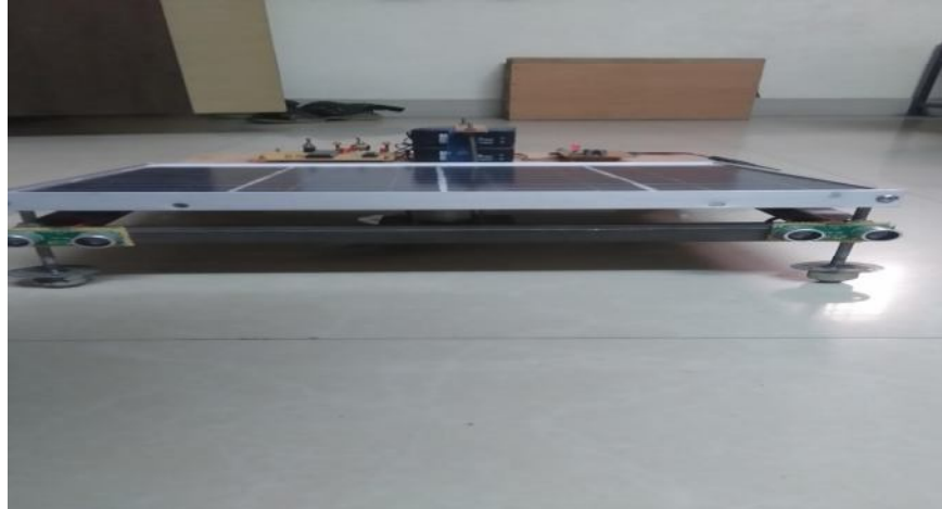
Figure 4:Grass cutter Movement