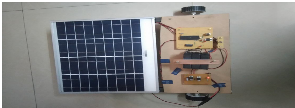
Fig 3: Charging Through Solar Panel

Our project fully automated solar grass cutter is successfully completed and results are obtained satisfactorily.