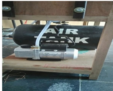
Fig.2. vacuum pump & vacuum chamber