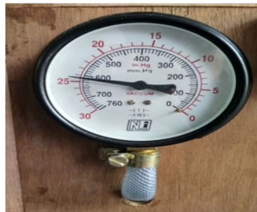
Fig.3. vacuum gauge