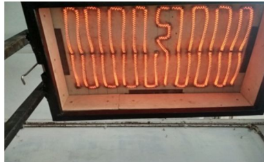
Fig.1. heater system