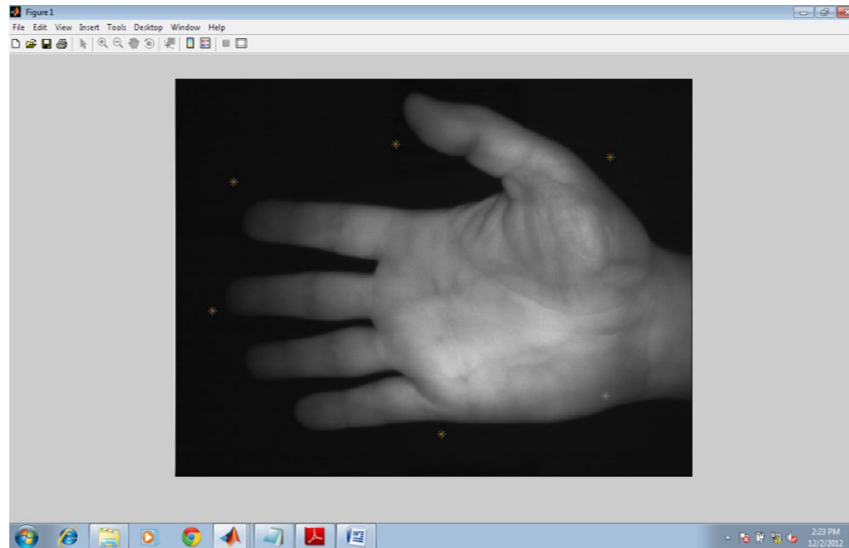
Figure 1. Image with random points