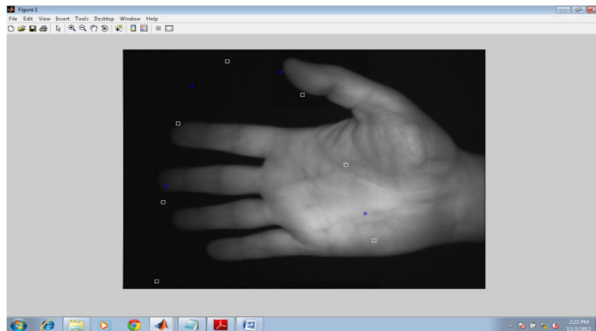
Figure 2. Image with converged points