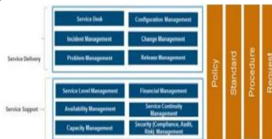
Figure 3. ITIL Framework.

The ITIL framework is part of ICT service delivery in many organizations, Figure 3. Related to the areas of ITIL are the organization and service specific policies, standards, and procedures required, and then the specific work instructions or request. Even with the use of virtual machines, virtual load balancers, automation and the use of Dev/Ops models, ITIL is a cornerstone of Big Data service management.