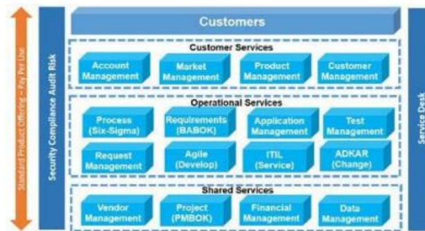
Figure 2. Methodologies within Big Data service.