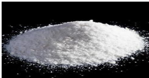
Fig.3 Poly Aluminium Chloride