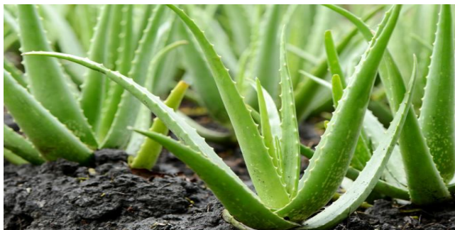
Fig. 2 Aloe Vera Plant