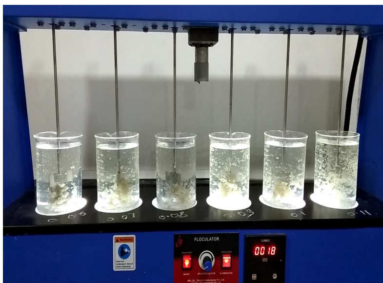
Fig. 1 Jar Test setup

For this analysis we have conducted a jar test which is most widely used experimental method for coagulation and flocculation. Before operating jar test the sample is mixed homogeneously by adding PAC dose in it and kept it for stirring at 25 rpm for 20 minutes, then it is kept for 30 minutes for the settlement of sludge. After settlement of sludge the parameters of supernatant water are experimented. For the same waste water we applied the dose of the combination of PAC and aloevera. The leaves of aloevera were washed under the tap water to remove the dirt. Thick green cover or epidermis was carefully separated from the gel part. Then the gel part was blended in mixer to form liquid and preserved in glass bottle in refrigerator. 1% of dilution of aloevera was made by using 1 ml aloevera gel in 100 ml distilled water similarly different percentage of aloevera solutions was made.