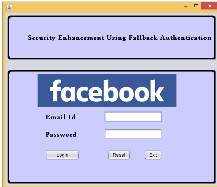
Fig. 1 User login homepage.