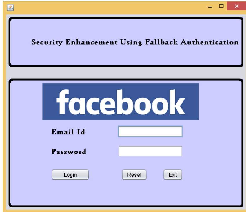
Fig. 1 User login homepage.