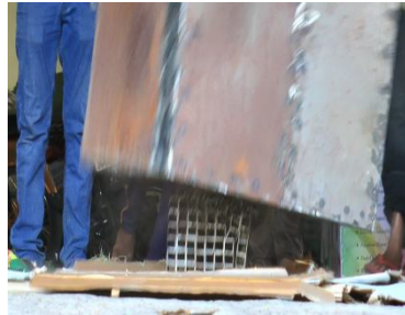
Fig . Attenuator after impact