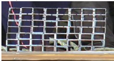
Fig. Actual manufactured steel alloy

B)Design and manufacturing of impact attenuator - Overall dimensions of the attenuator taken were 200 x 200 x 100 mm 3 .This impact attenuator is manufactured using steel alloy.