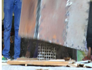
Fig . Attenuator after impact