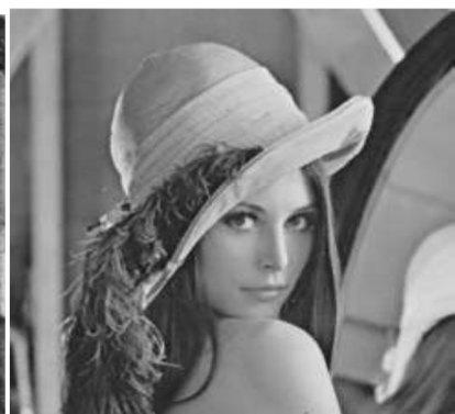
Fig15: Poisson noisy image