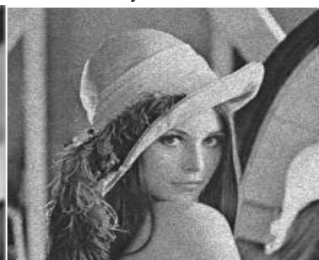
Fig18: Speckle noisy image