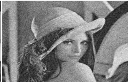
Fig3: Image With Gaussian Noise