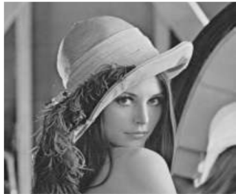
Fig2: Original Image

The following result shows images with different noises and corresponding denoising images using filter and Transforms.