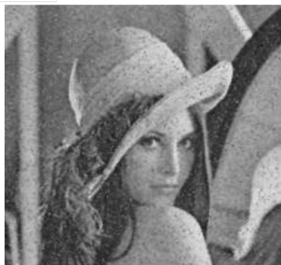
Fig11: Impulsive noisy image