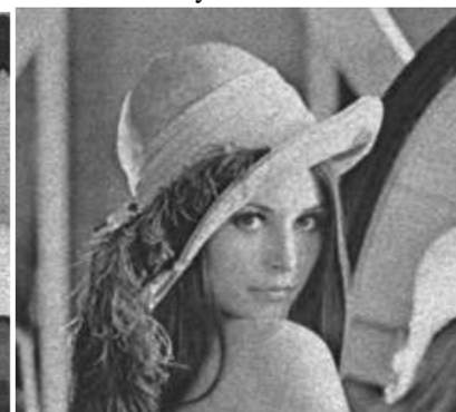
Fig19: Speckle noisy image