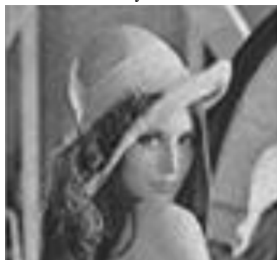
Fig17: Poisson noisy image