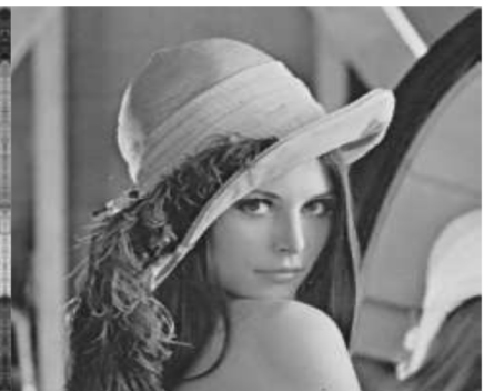
Fig10: Impulsive noised image filtered by Median Filter