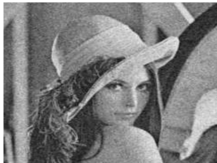
Fig5: Gaussian Noise image Filtered by Mean Filter