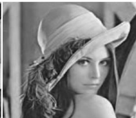
Fig25: Denoising by Curvelet Transform