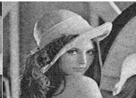
Fig6: Gaussian Noise image Filtered by Median Filter