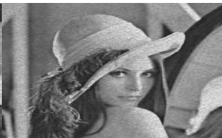
Fig21: Speckle noisy image