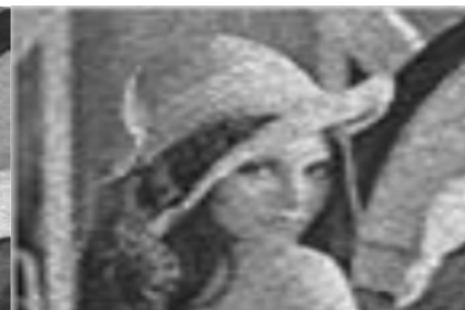
Fig22: Speckle noisy image