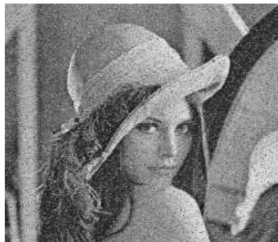
Fig8: Image with Impulsive Noise