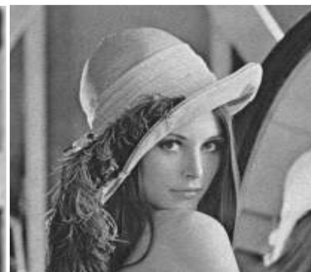
Fig13: Poisson noisy image