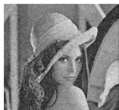
Fig14: Poisson noisy image