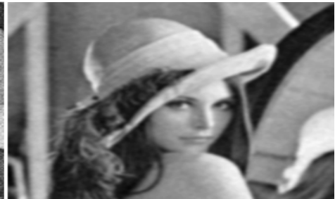
Fig4: Gaussian Noise image Filtered by Gaussian Filter