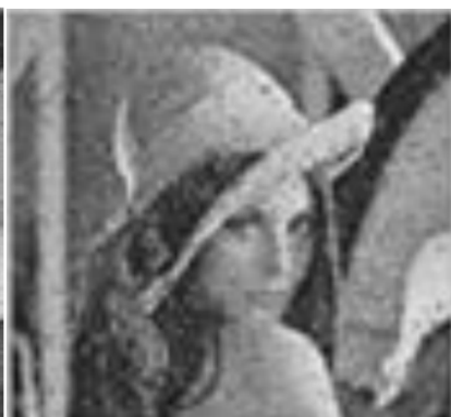
Fig12 : Impulsive noisy image