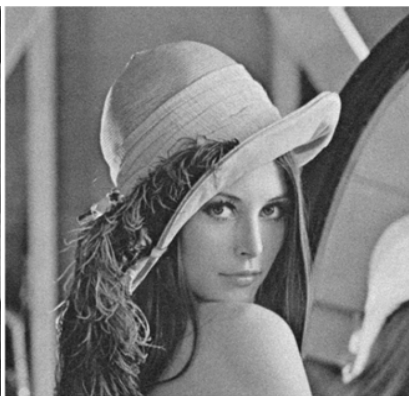
Fig24: Denoising by Contourlet Transform