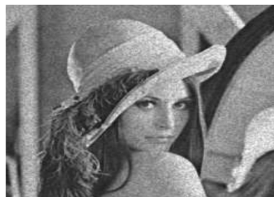
Fig20: Speckle noisy image