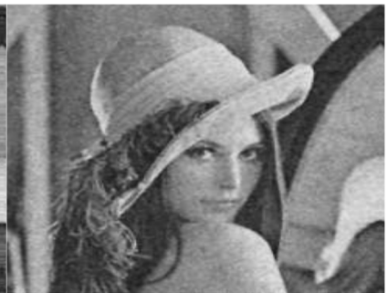
Fig7: Gaussian Noise image Filtered by wiener Filter