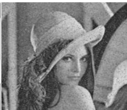
Fig16: Poisson noisy image