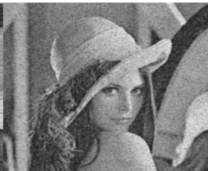
Fig9: Impulsive noised image filtered by Mean Filter