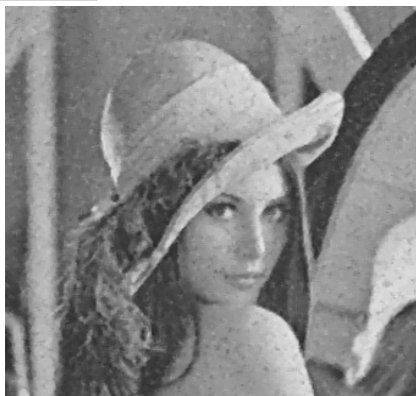
Fig23: Denoising by Wavelet Transform