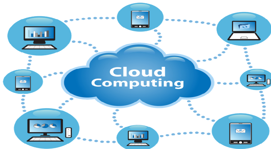
Figure1: Cloud Architecture

It is a unit, which is registered with the owner and uses the data of owner stored on the cloud. The user can be an owner itself as well.