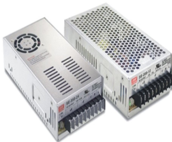
Fig 5: Switch mode power supply

SMPS SMPS stands for switch mode power supply. This converts the 230v single phase AC supply to 24V or 12V DC which is required for the PLC and for some input/output devices.