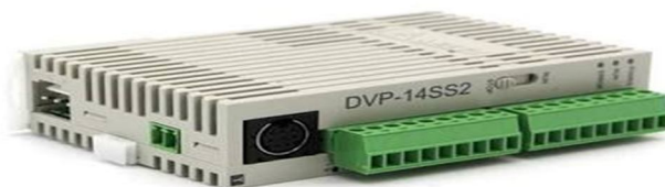
Fig 2: Programming Logic Controller (DELTA)