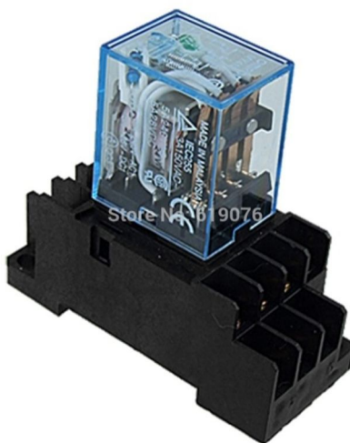
Fig 4: Relay

by opening and closing contacts in another circuit. When a relay contact is Normally Closed (NC), there is a closed contact when the relay is not energized.