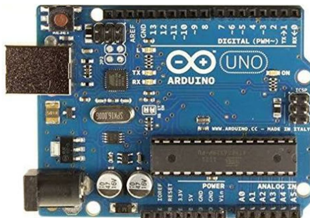
Fig 3: Arduino board