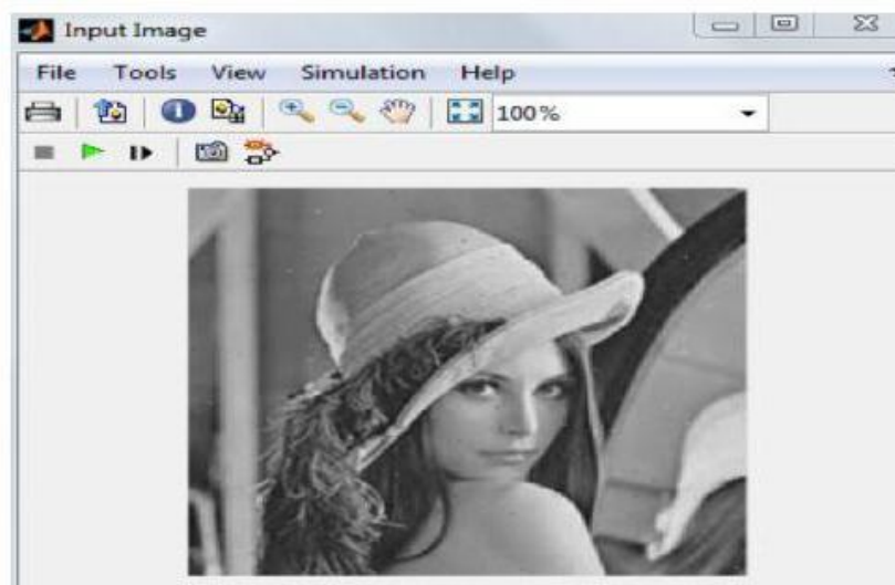
Fig 3.2 Input Image