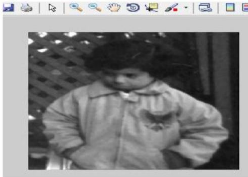
Fig 3.1 Enhanced Image

Image is given as input to first block i.e. transferring window structure. The image is given to transferring window architecture for masking the improved output image is as proven in below figure. The linear method uses min-max approach is finished and eventually the enhanced picture is acquired