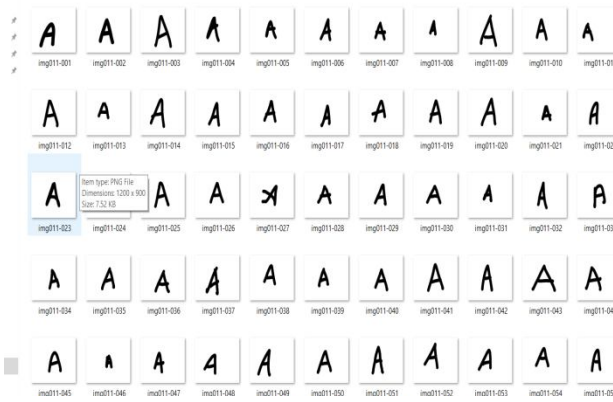
Fig.2. Data base of different A alphabet