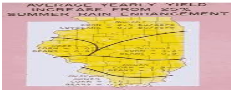
Fig.2. Shows the weak monsoon period is increased with cloud seeding process and it also affect the productivity of crops.

As the figure show the complete process of cloud seeding. The clouds are targeted which only about to 1-2 km from earth surface. The colour of these clouds is brownish. These clouds are called Nimbus. The silver iodine or dry ice used as the form of feed sometimes a salt and water solution is also used. 150kg salt is require for 1000literes of water. The solution is placed into the 250 litres containers. So that transportation may be done so easily. After the plane enters into the clouds and the dry ice react with the clouds and completely follow the condensation process. The salt water encourages the formation of dry ice particles. The water drop convert into the heavily drop water and enough heavy to processing the precipitation or the rainfall. After that process the rain may falls after or within 15-20 minutes of the cloud seeding. This process may not 100% success but show the ideas for the futures droughts problem may be reduced. However this technique may also be used to control the heavy rainfall intensity. In this problem the the same procedure follow but aircraft is launch towards the direction of wind.