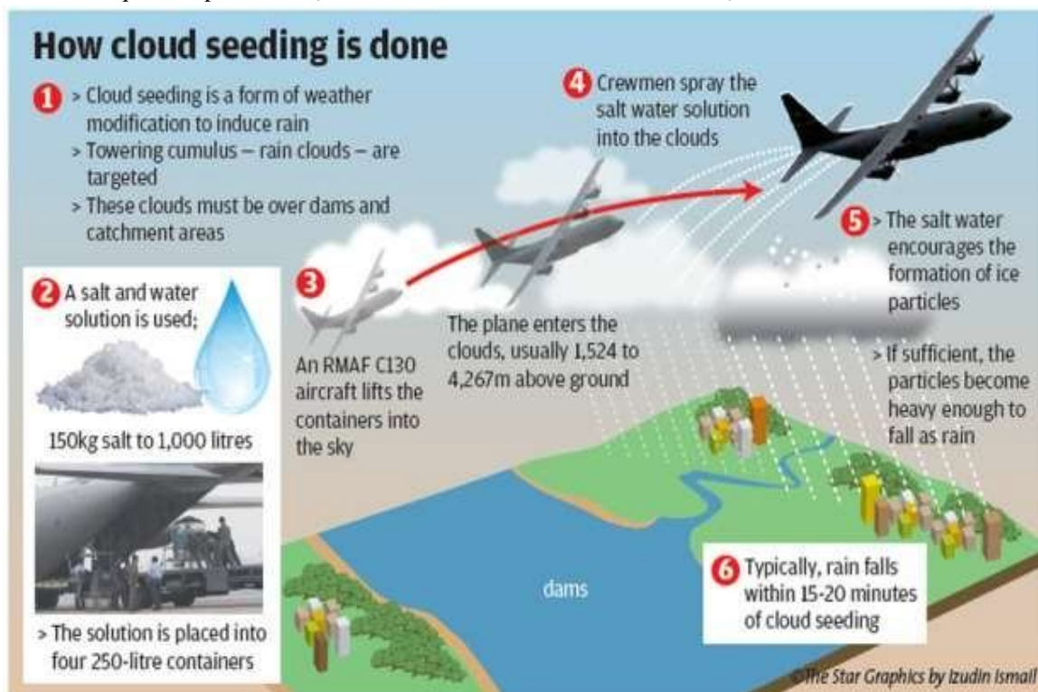
Fig.1. Process of cloud seeding.

Aircraft, mini- blasting rockets (explosive rockets) ,Balloons may be used in cloud seeding ‘ Through the cloud seeding process with the help of Aircraft silver iodine (dry free) sprayed into the cloud. Silver iodine Attract the water drops which are already exists in the clouds. When they comes contest in the dry ice they convert into the drops. And these drops fall in the form of rain on the earth. Mean while this Process is not 100% succeed or complete successful. Commonly the range of or distance of clouds 1-2 km from the earth, this technique is implemented (these clouds one also called Nimbus cloud). The colour of clouds Brownish.