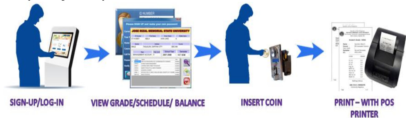
Fig. 1 General System Architecture

A coin slot for a mechanical coin-acceptor unit with a coin slot opening integrated in the front plate, coin slot chamber and coin channel. The shoulder is build-up to vibrate as a coin reflector/membrane so that an impact to the inserted coin in the slot is generated. In the coin slot chamber, there is a renewed reversal of direction in the direction of the coin channel [6]. The whole device is then connected to the parallel communication port and interface using inport32.dll library for Windows 7 Application Programming Interface (API), which is a collection of commands/instructions, protocols, objects and functions used by advanced programmers to create software or interact with external system. It also provides software developers with standard and ready-to-use commands in performing essential operations.