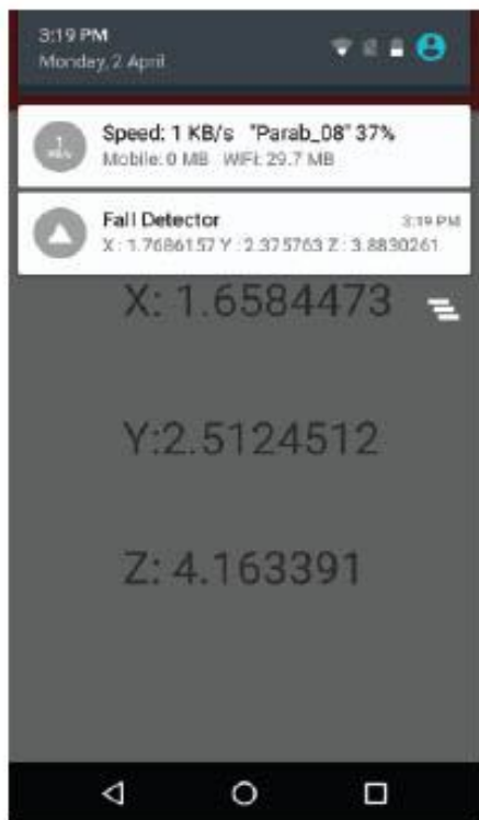
Fig. 5. Application running in the background