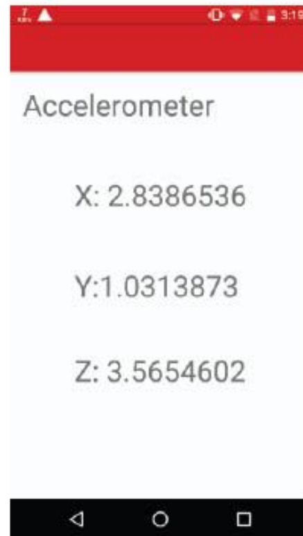
Fig. 4. Application running