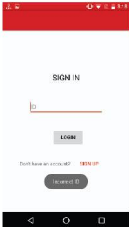
Fig. 3. Unregistered ID entered