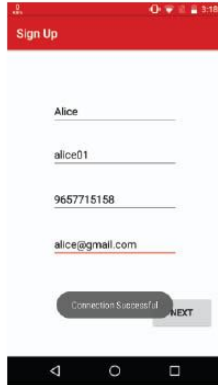
Fig. 2. Valid data entered