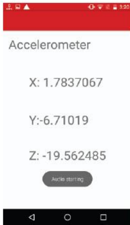
Fig. 8. Alerting user with audio message