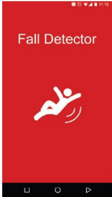
Fig. 1. Splash screen