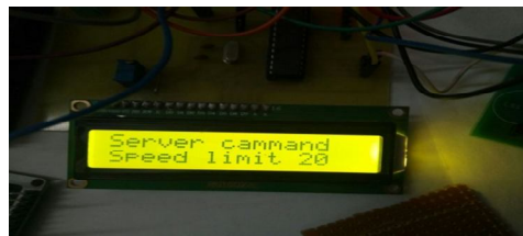
Fig.(2) Result for speed limit 20