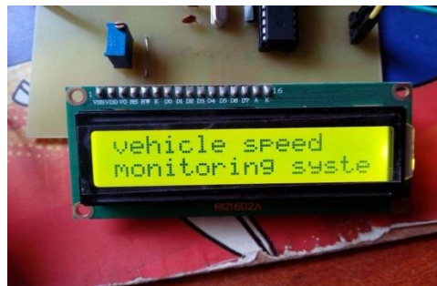
Fig. (1) real time vehicle speed monitoring system.