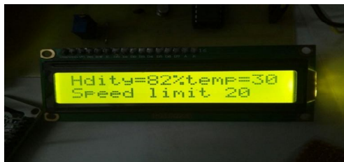
Fig.(5) Results in auto command