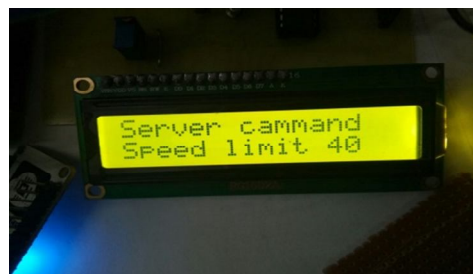
Fig.(3) Result for speed limit 40