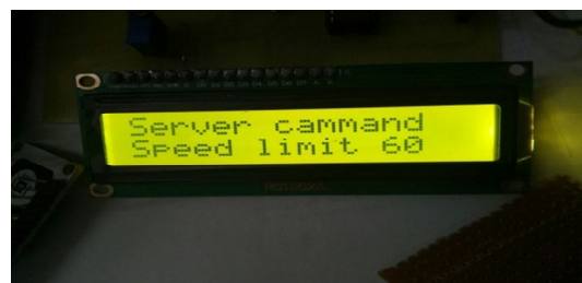
fig.(4) Result for speed limit 60