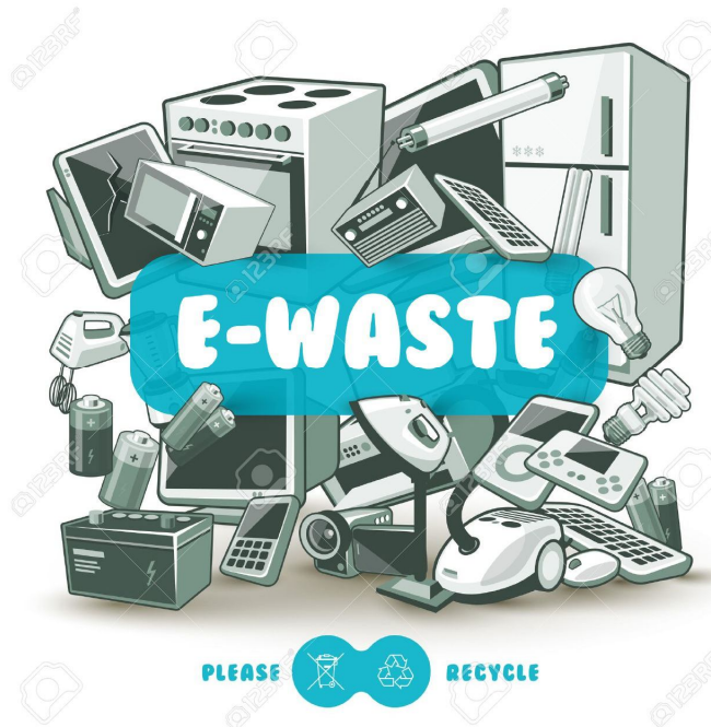
Fig 1:Depicting E-waste

Electronic waste portrays disposed electrical or electronic gadgets. Utilized gadgets which are bound for reuse, resale, reusing, or transfer are likewise considered e-waste. Informal preparing of e-squander in developing nations can prompt unfriendly human well being impacts and ecological contamination. The negative environmental impact of irresponsible disposal of electric waste is due to the harmful contents of the devices which include high levels of hazardous materials such as Mercury (Hg), Lead (Pb), Cadmium (Cd), Chromium (Cr), PVC, and Brominated Flame Retardants. At the end-of-life of an electronic device, the device can be disposed of, recycled, or stored. When an electronic device is disposed of in the trash the device will end up in a landfill and those toxic materials will potentially seep into the environment.