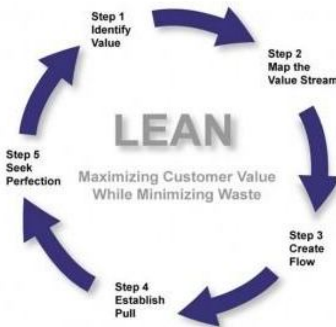
Fig 4:Principles of lean

1) Lean is a process which in its core aims to reduce waste to minimum.: Lean Thinking describes a process of identifying and removing waste in a value stream. The process discerns three types of activities: activities that clearly create value; activities that create no value for the customer but are currently necessary to manufacture the product; and activities that create no the customer, are unnecessary, and therefore should be removed immediately; i.e., waste.