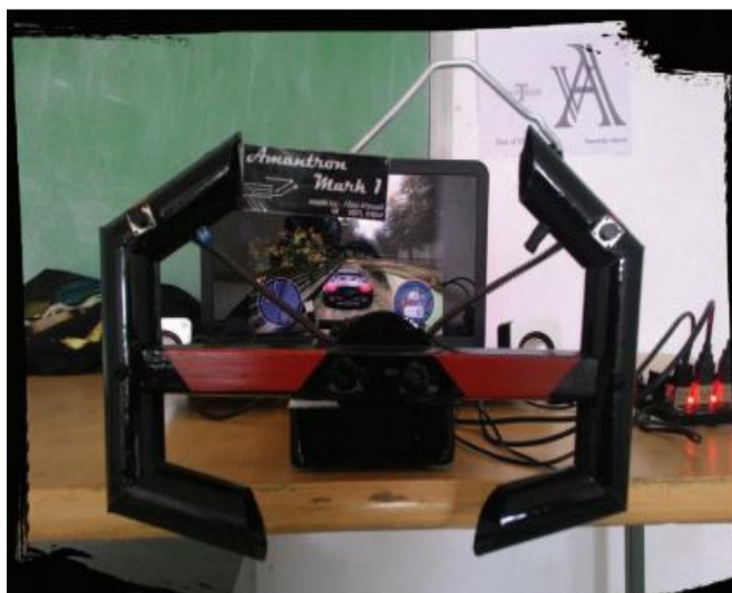
Fig 3:A Close-Up View Of The Steering Wheel, Which Includes Nitro Buttons To Speed Up The Car During Game Play.

The Amman Tron Gaming Console-1 is inspired by control systems used in sports cars, such as having a gear shifter behind the steering wheel for manipulating the gears up and down. There are also nitro buttons built on the steering wheel. Which are used to enable the boost feature to speed up the car rapidly in the game. To introduce the acceleration and braking of the car into the game, a transmission shifter (Fig. 3) was introduced, which is responsible for driving the car in both forward and reverse directions. The transmission shifter is constructed to slide in the front and back directions by the use of a two-way switch that enables the selection between two different ASCII values that define the forward and the reverse motions.