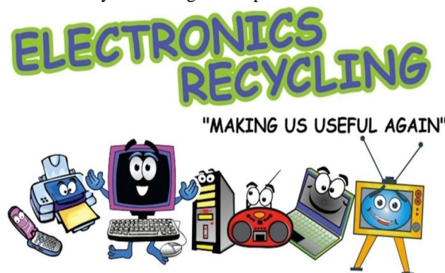
Fig 5: Recycling of E-waste

The prime utilization of Electronic Waste Management is to guarantee that the hazardous segments are discarded properly and the valuable segments are returned in for further use by decreasing the impact of e-waste on condition.