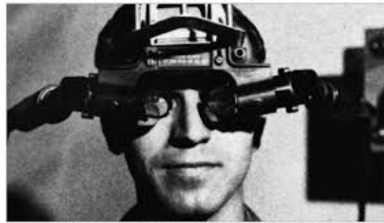
그림 2 이반 서덜랜드가 1965년에 개발한 최초의 AR 기기 'The Sword of Damocles'

was used to visualize the information, it was the first time when we connect with virtualization. Before 1950, computer was a bulky or huge machinery which was used by the military only. The computers were powerful machines that could help in take out a town's power supply. Well in 1961, a company decided to attach a headset called headsight. A company named Phico Cooperation made a project to produce visualization with simulation together with a tracking system., which was also used by military purposes. For example, pilots can use VR for their training purpose to flight in extreme darkness and in extreme tough situation without putting themselves in actual. In 1965, a person named Ivan Sutherland tried to copy the real world with the help of this invention, by naming it Ultimate Display. This invention was like a world in itself. According to his vision, this invention focus more on 3D objects.