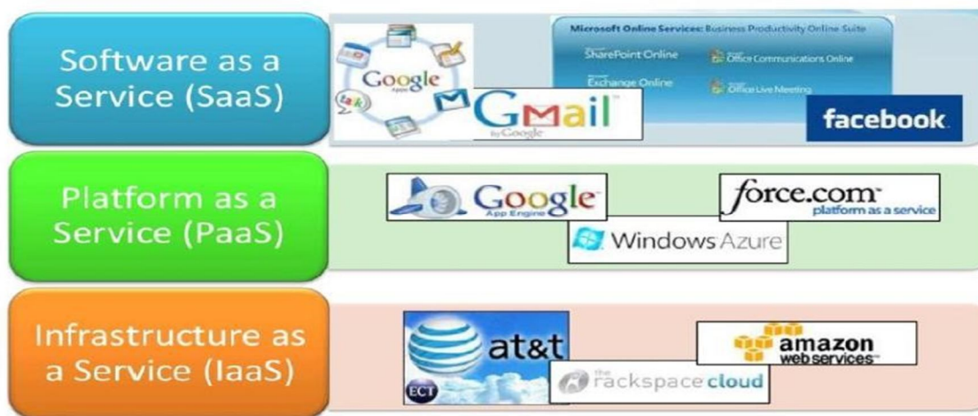
Fig. 1.1 Cloud Service Model