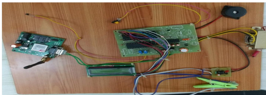
Fig 3. Experimental setup of intelligent patient monitoring system