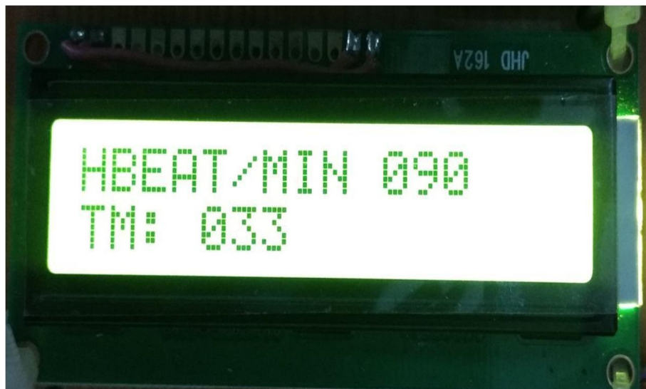
Fig 4. Heartbeat per min & temperature displayed on the LCD screen