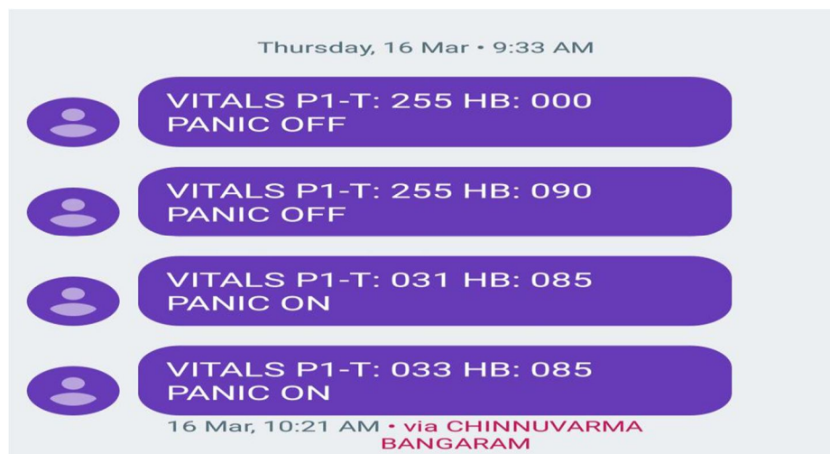
Fig 5. Samples of hardware output