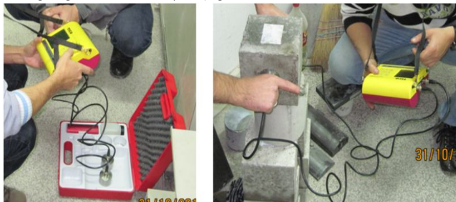
Fig. 3 Determining the modulus of elasticity of concrete with portable ultrasonic testing instrument type Proceq-TICO

Experimental investigations for determining the modulus of elasticity of concrete based on measured velocity of ultrasonic pulse, using the Non-Destructive Ultrasonic Pulse Velocity Method were performed with portable ultrasonic testing instrument type Proceq-TICO [9] with measuring range from 15 to 6550 \mu\text{sec} (Fig.3).