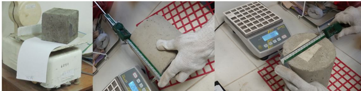
Fig. 2 Measuring the geometric dimensions and weight of test specimens

For all the specimens the geometric dimensions and weight is measured, after that the weight per unit volume \gamma_c is calculated (Fig.2).