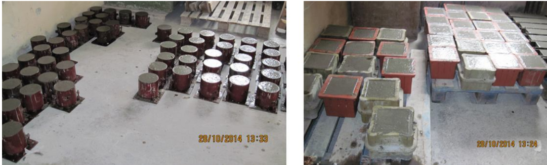
Fig. 1 Specimens for testing according to EN 12504-4:2004 [2]

For the researches for modulus of elasticity of the concrete 54 cylindrical test specimens with dimensions 150/150 mm and 27 cubic test specimens with dimensions 150/150/150 mm were produced (Fig.1) according to EN 12390-2:2009 [5], [7]. They were prepared of concrete grade C25/30, fine fraction of coarse aggregate ( d_{max}=12 mm), consistence S3. Test specimens were with precise dimensions, flat and smooth sides, straight edges and corners.