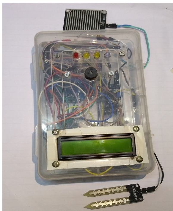
Figure 3 : Hardware Setup

Power supply of 12V is used for running this hardware system.