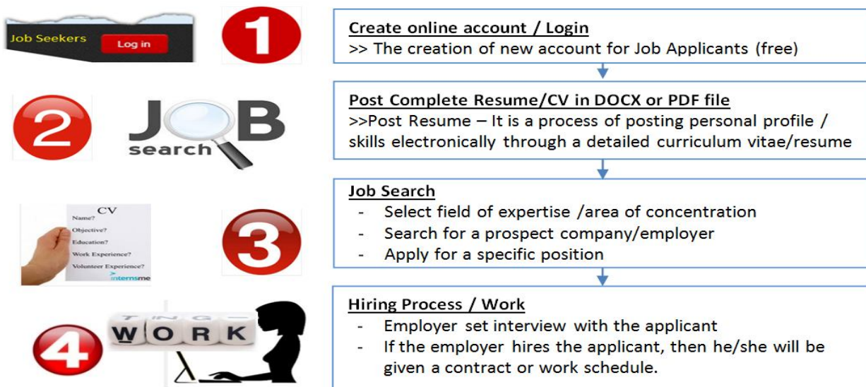
Fig. 2: Steps in Applying a Job for applicants