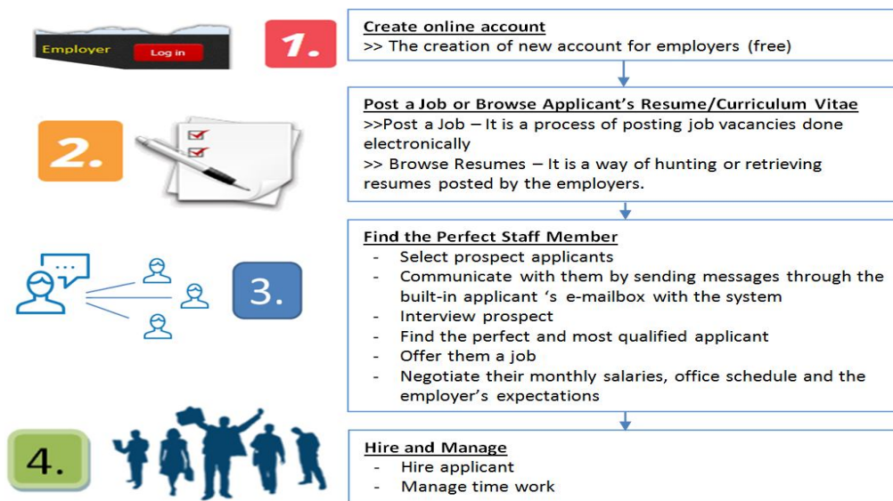
Fig. 1 Steps in Posting Jobs for Employers/Recruitment Agencies

The next figure illustrates the processes in applying jobs for applicants. The first step points out that the job seekers need to create an account using the website to enter related personal information including the username, password, email address and any other related documentary evidences that attract job hunters namely: job seekers' educational qualification; field of expertise; trainings and seminars attended; and work related experiences. For the job seekers who already created an account using the same website, the user may fill-in the username and password directly to visit the user account page that contains different features customizing, managing accounts and updating profile. Right after login, the job seekers may post complete and detailed resume or curriculum vitae as reference for the job hunters presented in step 2. The third step is a process wherein job seekers may select/search posted job vacancies according to its area of concentration or search for a prospect company/employer to apply corresponding position using the system. Right after reading the job search result, the fourth step will then follows wherein the hiring process took place. Applicants may consider appointments or job interview through email or phone calls from the employer. In the event that employer satisfied with the result of the interview process, job seekers may be given a contract or a working schedule or any direct instructions from the job hunters.