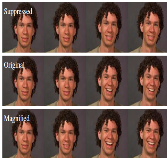
Fig.1. Magnify or suppress an expression in video.

Video on the web is growing at astonishing rates. In 2011, on YouTube alone, every minute people upload 8 years of video content. While video capture, bandwidth and storage have become easier over time, semantic editing of video content remains a very challenging problem. Consider the problem of making a person smile in an image. This is not as simple as cutting a smile from another image, pasting it and blending the results. The entire face changes its shape, the chin becomes wider and the eyes become narrower. The appearance depends on the pose of the person as well as the identity: everyone smiles in a unique way. While a Photoshop expert with sufficient amount of time could change one's expression in an image, doing so in video is prohibitively expensive. The time dimension adds new sets of constraints, such as temporal coherence, and the temporal "signature" of an expression.