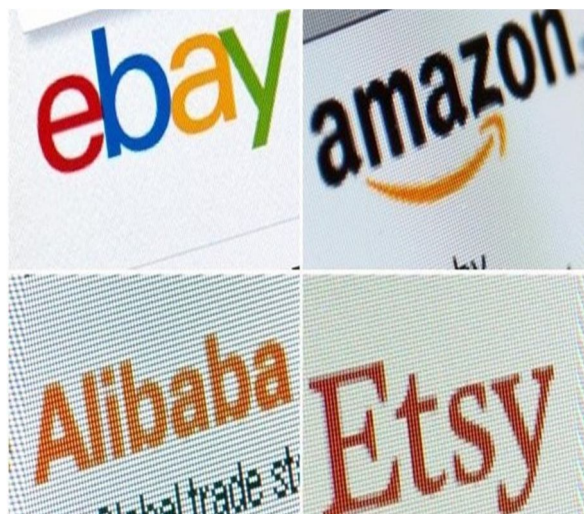
Fig3: Types of ecommerce companies