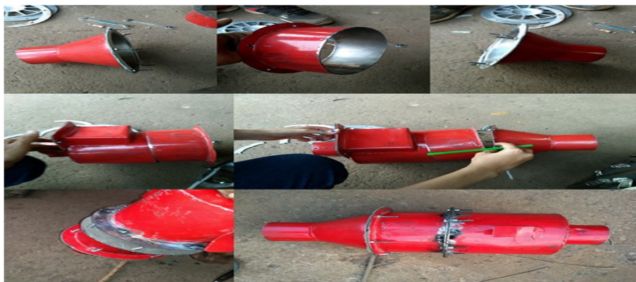
Fig.1 Fabrication of catalytic converter

in the present work a couple of modifications as well as alterations have been designed in order to improve the retention period of tailpipe emission to allow some more time for its oxidation and in that way to decrease the hazardous release. For the modification catalytic chamber is open using arc welding and cutting then the two sets of stainless steel wire mess having 1.5x1.5mm opening is installed inside the convertor and fitted with the help of nuts and bolts 9 . It is designed in such a way so that the area of cross section at the point where the wire mess is fitted is about two times the area of cross-section of exhaust manifold of the engine 12 as shown in fig.1