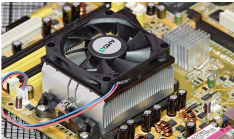
Fig. 2: A fan-cooled heat sink on the processor of a personal computer. To the right is a smaller heat sink cooling another integrated circuit of the motherboard.

A heat sink is designed to maximize its surface area in contact with the cooling medium surrounding it, such as the air. Air velocity, choice of material, protrusion design and surface treatment are factors that affect the performance of a heat sink. Heat sink attachment methods and thermal interface materials also affect the die temperature of the integrated circuit. Thermal adhesive or thermal grease improve the heat sink's performance by filling air gaps between the heat sink and the heat spreader on the device. A heat sink is usually made from copper or aluminum. Copper is used because it has many desirable properties for thermally efficient and durable heat exchangers. First and foremost, copper is an excellent conductor of heat. This means that copper's high thermal conductivity allows heat to pass through it quickly. Aluminum heat sinks are used as a low-cost, lightweight alternative to copper heat sinks, and have a lower thermal conductivity than copper.