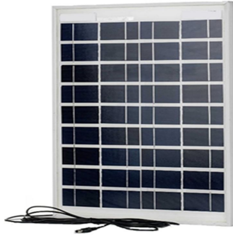
Fig. 3: Solar PV modules (top) solar hot water panels (bottom) mounted on rooftops