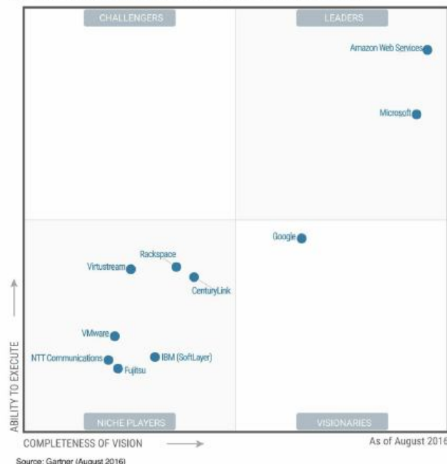
Figure 1. Magic Quadrant for Cloud Infrastructure as a Service, Worldwide

AWS provides many cloud services that you can combine to meet business or organizational needs . AWS provides a highly reliable, scalable, low-cost infrastructure platform in the cloud that powers hundreds of thousands of businesses in 190 countries across the world.