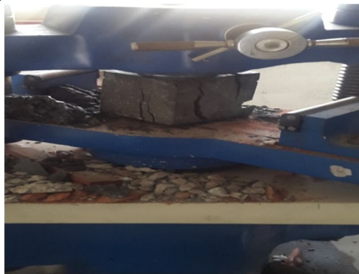
Fig.3.5 Compression test on CTM