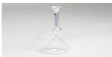
Fig.3.4. Le Chaterlier's flask

Volume of cement particle = V_2 - V_1 ml