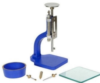
Fig.3.3. Vicat's Apparatus