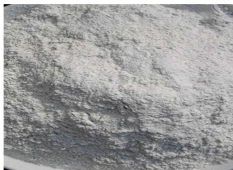
Fig 3.1 Asbestos Cement Sheet Waste Powder

Asbestos cement sheet waste are taken from Narwana ( Haryana). They were crushed into powder form by manually operating a hammer and passed into 90 micron IS sieve . The specific gravity of Asbestos Sheet waste material is 3.11 and fineness modulus of 3.07. Water absorption of Asbestos Sheet waste material is 4.46 %.