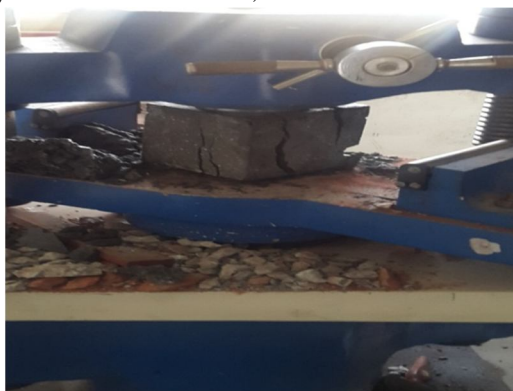
Fig.3.5 Compression test on CTM