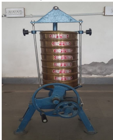
Fig 3.2 Sieve shake

Results The residue by weight not to exceed 10% for ordinary Portland cement.