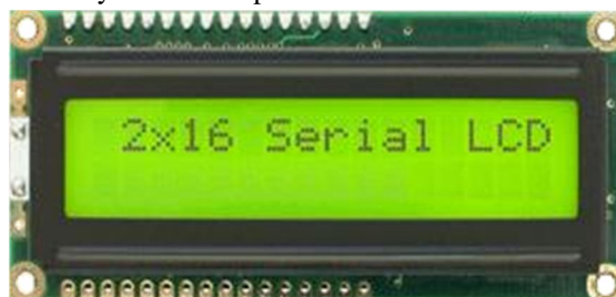
Fig. 2X16 LCD Display

LCD's have been become most popular over recent decades for Data/information visible in many smart devices. The Display devices are mostly controlled by controllers. They makes complex/convolve devices easier to operate.