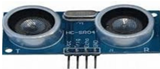
Fig. Ultrasonic Sensor (HC-SR04)