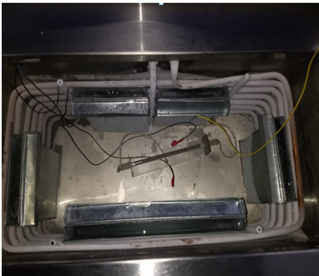
Fig.2 Low side evaporator cabin with PCM