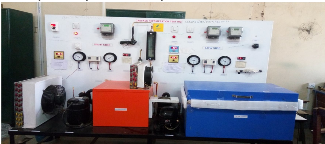
Fig.1 Cascade refrigeration system experimental setup

The experimental set up is as shown in the following figure. It consists of a two systems interconnected one is low side and another one is high side. Second figure shows the picture of low side's evaporator cabin with PCM.