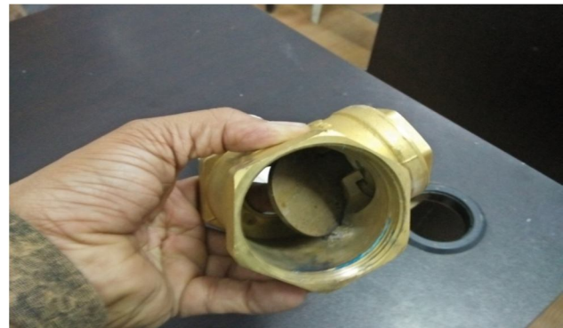
Fig.:Actual picture of various NRV valves

Hilbert Schenk Jr has discussed two basic theories of experimentations to formulate the experimental data based models or field database models for prediction of behaviour of such complex phenomenon.