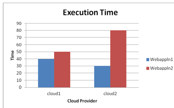
GRAPH-II Execution Time Calculation