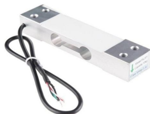
Figure 1: Weight Sensor (Load cell)

It is used to measure the weight of cylinder and it has a capacity of 40kg . The function is to give output voltage as per force/weight applied to it. . It is basically a device that measures strain and then converts force into electric energy which serves as measurement for scientists and workers.