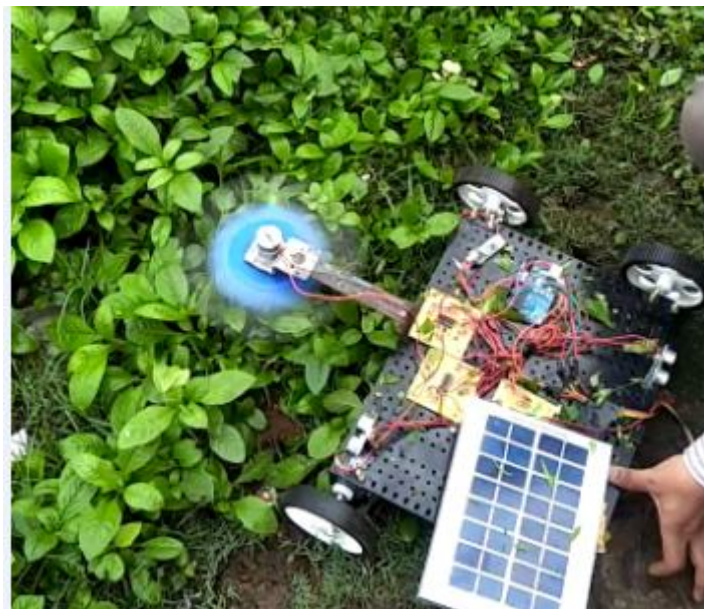
Figure 3 grass cutter cutting the grass

This project is more appropriate for an ordinary man, since he has much more advantages, that is, without the cost of fuel, pollution and fuel residue, less wear for less number of moving components and this can be operated through the use of solar energy.