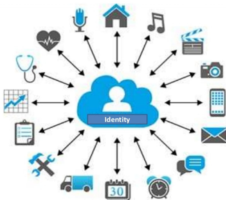
Figure 2: Identity in a digital world system.

Designing intentionally for vulnerable communities, as mentioned above, one issue that comes up often in responsible data analyses is that of power. Who holds the least amount of power in a particular situation, and how are their needs being addressed.