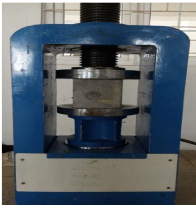
Table 2: Compressive Strength of M30 Mix concrete

1) Compressive Strength of Cubes: A cubic compressive strength test was performed on a 150 mm sized cube at 7 days and 28 days according to IS 516. The compression test is the most common test performed on hardened concrete, in part because it is easy to test, in part because most of the desirable properties of concrete have a qualitative relationship with its compressive strength. The compressive strength test sample has a size of 150 mm x 150 mm x 150 mm. After 28 days of curing, the samples were tested at a capacity of 2000 kN. The compression test is performed on a cubic or cylindrical sample. Prisms are also used, but they are not common in our country. Sometimes the compressive strength of concrete is determined using the portion of the beam tested in the bend. After the bending failure, the ends of the beam remain intact, and because the beam typically has a square cross section, the partial beam can be used to find compressive strength. The length of the cylindrical specimen is equal to twice the diameter.