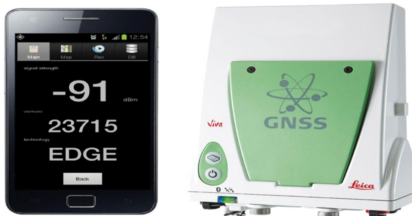
Fig.2. Civilian Receiver

The first civilian application of these receivers was on large ships as their prices have fallen receivers are now incorporated in cars as well as phones. They became common in small vessels as well. In case of cars these systems may interact with the CD-ROM player of car in order to obtain map information and present it on a dash-board video display.