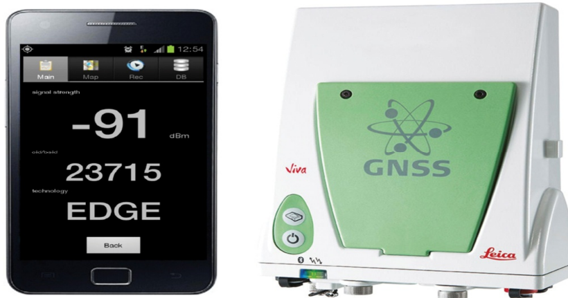
Fig.2. Civilian Receiver

The first civilian application of these receivers was on large ships as their prices have fallen receivers are now incorporated in cars as well as phones. They became common in small vessels as well. In case of cars these systems may interact with the CD-ROM player of car in order to obtain map information and present it on a dash-board video display.