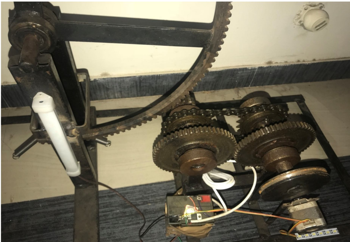
Fig:-3 Uni directional Gear Mechanism used in the design