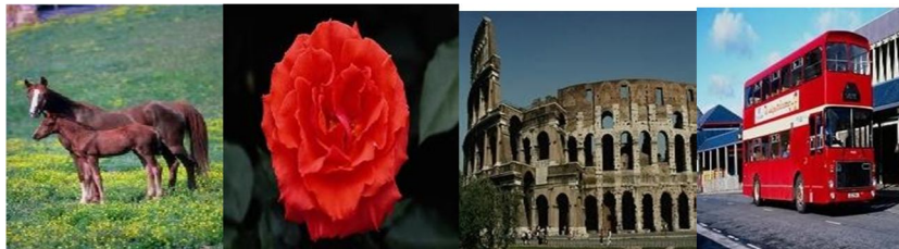
Fig.2 Sample database images

Sample images from Corel dataset are shown in Fig