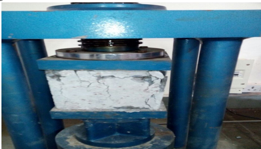
Fig.1 Compressive Testing Machine