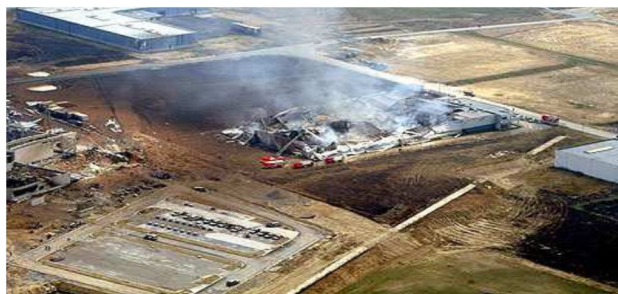
Fig 2: Explosion due to gas leakage in pipeline across Ghislenghien, Belgium city