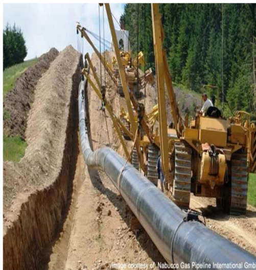
Fig 1: An example of a pipeline system

Natural gas is a naturally occurring hydrocarbon mixture consisting of methane, nitrogen, carbon dioxide and hydrogen sulphide. It is usually odorless, colorless and shapeless. It is also an energy source used as fuel for heating, cooking, vehicles etc. To carry such gases a pipeline system is developed. A pipeline is a system of equipment designed to transmit the gases from one place to another. With sophisticated technologies, the pipeline developments are gaining more advantages as they are preferred to be economical and safest mode of transport.