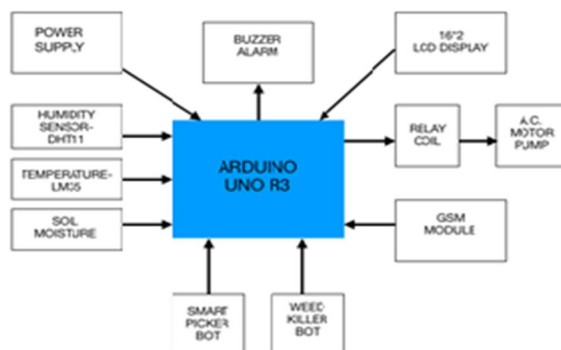
Fig.2 System Architecture

A humidity sensor (or hygrometer) senses, measures and reports the relative humidity in the air. It therefore measures both moisture and air temperature. Relative humidity is the ratio of actual moisture in the air to the highest amount of moisture that can be held at that air temperature.