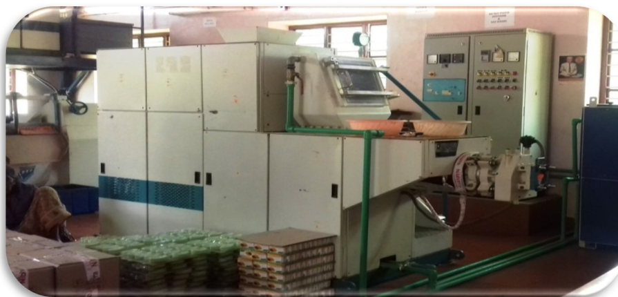
Fig.4 Aloe processing unit