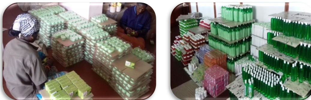
Fig.7 Processed Aloe – As an industrial product