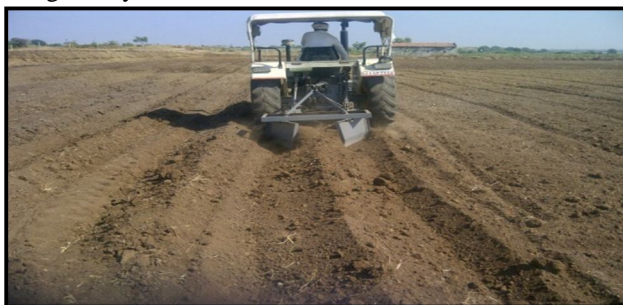
Fig.2 Aloe cultivation