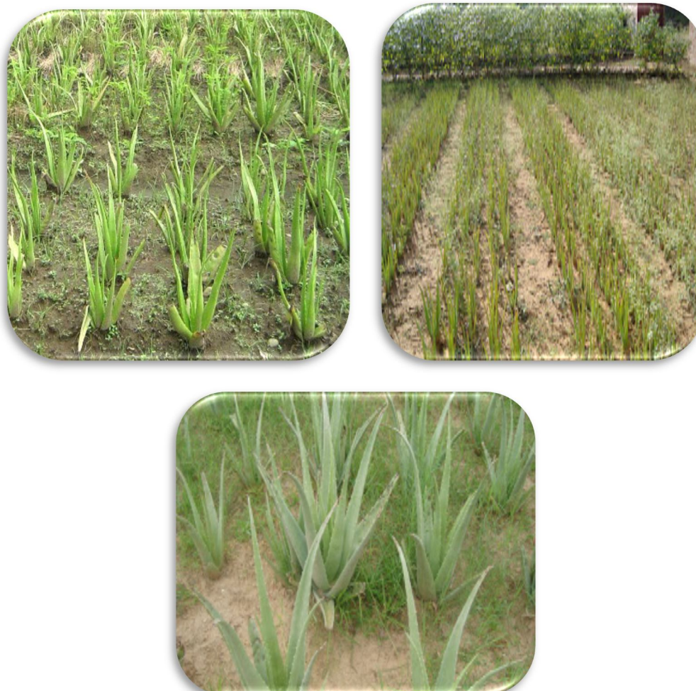
Fig.3 Aloe Planting