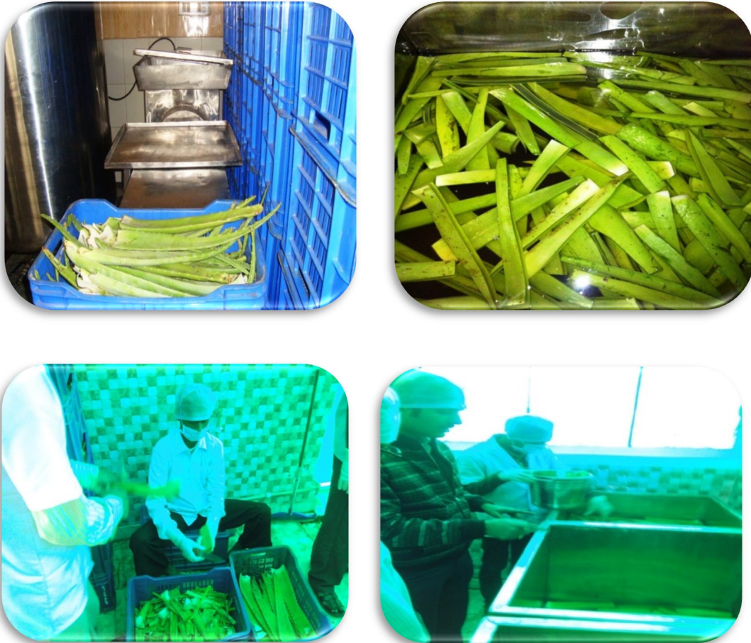
Fig.5 Aloe Extraction