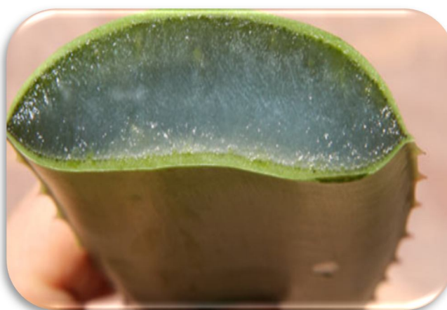
Fig.1 Aloe gel

The aloe gel predominantly comprises of water (99.1%) and mesophyll cells (0.9%), which can be isolated into 3 particular portions: cell divider, micro particles, and fluid gel which accounts for 16.2%, 0.7%, and 83.1% of dry mass, respectively. The transcendent sugar part present is mannose which includes 20.4% in cell divider, 32.2% in micro particles, and 62.9% in the fluid gel. Muco polysaccharides are mostly present as acemannan which refers to a exceedingly acetylated, \beta -1-4-connected polysaccharide made for the most part of mannose with different side chain glycosylation patterns. The plant also incorporates different amino acids, proteins, and vitamins. The IASC has a standard in which "entire aloe vera leaf gel" needs to stick to the solids (0.46%–1.31%); pH (3.5–4.7); calcium(98.2–448 mg/L); magnesium (23.4–118 mg/L; malic corrosive (817.8–3,427.8 mg/L); acemannan with crude materials ( \geq 5\% by dry weight); isocitrate; crude materials powder content ( \leq 40\% ); aloin.