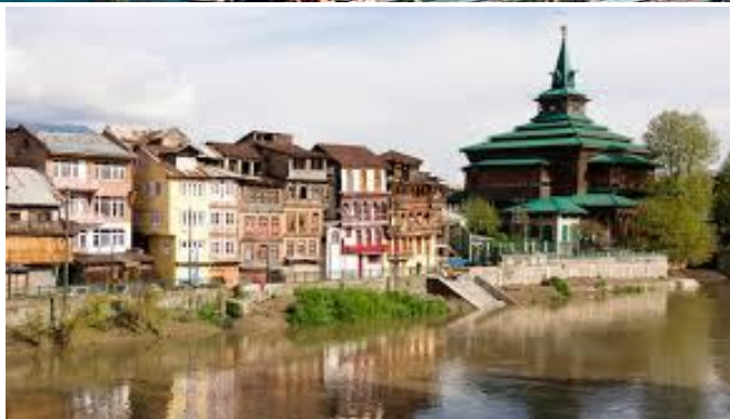
Fig.1 Pictures showing the scenic Beauty of Srinagar city.

In India, MSWM is governed by MSW (Management and Handling rules) 2016. MSWR and the implementation of MSWR is a major concern of urban local bodies across the country. Due to its peculiarity, the problem of Solid waste is much more adverse in the Srinagar City. Our study presents a critical and comprehensive view of nature/ composition of waste, techniques adopted in past, addressing the weaknesses in the present system, the management practices that need to be adopted and the overall impact of a perfect solid waste management in the Srinagar City. (3,4)