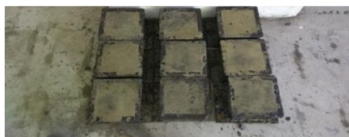
Fig 4.2 Conventional Cubes

Similarly, for each test that was conducted, the total number of 30 cylinders were prepared of size 150x300mm. The specimens were casted by using mixture as that used for cube casting and cured for 28 days at normal temperature to determine the split tensile strength of concrete.