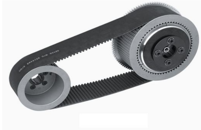
Fig.3: A belt drive.

In this a belt is a looped which is a strip of flexible material used to mechanically link two or more rotating shafts. It offers smooth transmission of power between shafts at a considerable distance. Belt drives are used as the source of motion to efficiently transmit power or to track relative movement.