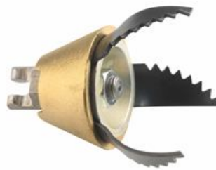
Fig.1: A three blade cutter.

Opening clogged drains calls for tough equipment. That's why sewer and drain cleaning equipments are made with the most durable components. They are high quality tools and are designed to be dealt as replacement tool units.