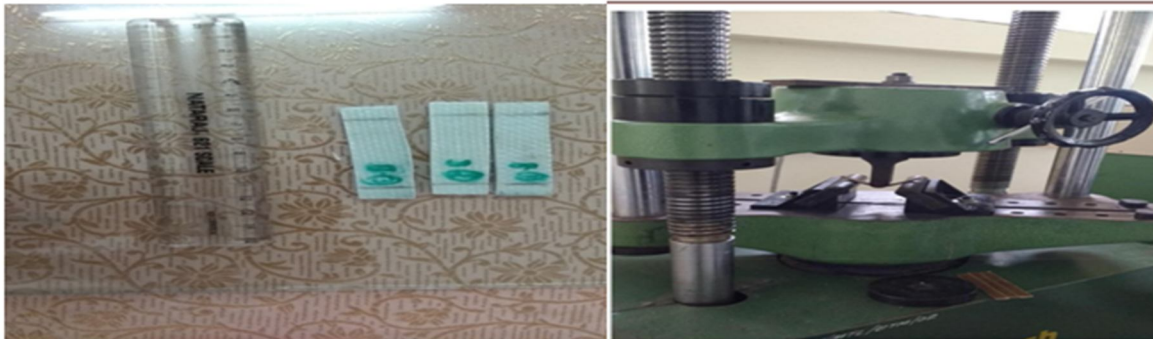
Fig 6:3-point bending test specimen and experimental setup

Bending strength also known as the flexural strength is the maximum stress in the material just before it yields during a flexural loading. The flexural test for the specimens was conducted according to ASTM D790. The specimens of size 125 mm x 12.7 mm x 4 mm were tested with a cross head speed of 1 mm / min.