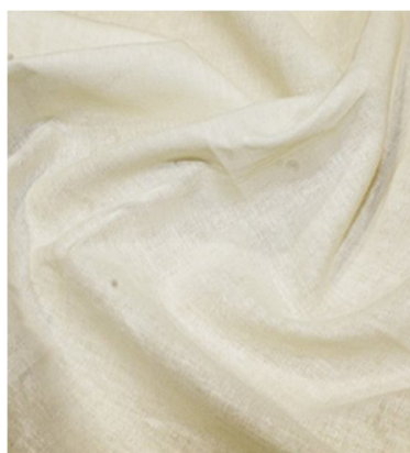
Fig 1: Ramie fiber

Ramie fiber has comparable specific modulus and strength to traditional synthetic fibers for composite production. There are many advantages of using Ramie fiber; renewable and biodegradability being the significant ones. A technology of separating ramie core and bast has been developed, thus there is a possibility of using the entire Ramie plant or its separated parts in the production of a composite. The advantages of ramie fibers over traditional reinforcing materials such as glass fibers and mica are acceptable specific strength properties, low cost, low density, high toughness, good thermal properties, reduced tool wear, reduced dermal and respiratory irritation, ease of separation, enhanced energy recovery and biodegradability. The ramie fiber is shown in the figure below.