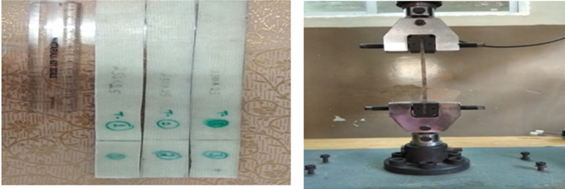
Fig 5:Tensile test specimen and experimental setup

Ultimate tensile strength, often referred to tensile strength is the maximum stress that a material can withstand while being stretched or pulled before fracture. The tensile test for the specimens was conducted according to ASTM D3039. The specimens of size 250 mm x 25 mm x 4 mm were tested with a cross head speed of 1 mm / min.