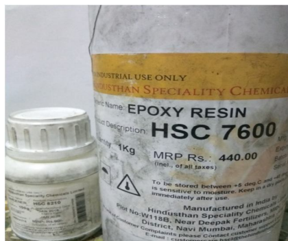
Fig 3:Resin and hardener

The reinforcement, matrix materials and processing chemicals used in the present research are shown in Table I