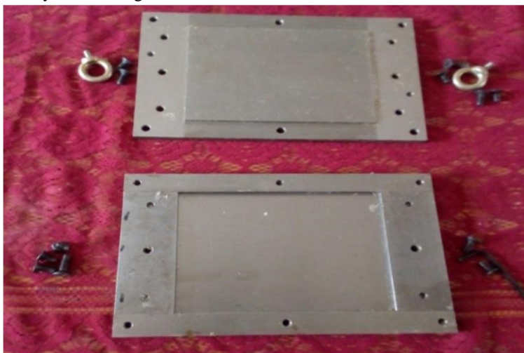
Fig 4: Mold used for hand layup

The hand lay-up is one of the oldest and most commonly used methods for manufacture of composite parts. Size of the mold hat is used is 300mm × 250mm × 5mm. The working surface was cleaned with thinner to remove dirt and a thin coat of wax is applied on the surface to get smooth finish. Then a thin coat of polyvinyl alcohol (PVA) is applied for easy removal of mold. Ramie and jute fibers are cut to the required dimensions for test specimen pre-impregnated with matrix material and placed one over the other in the mold. Hand layup process was carried out with epoxy as matrix and bidirectional jute fibers. Three laminates were produced with 35%, 40% and 45 % weight percentage of jute and ramie combination (each fiber equally divided). Resins are impregnated by hand into fibers by rollers. Laminates are left to cure under standard atmospheric conditions by loading it externally using about 75 kg weight to allow the effective curing of the resin. All test specimens were molded and prepared according to ASTM-D standard to avoid edge and cutting effect, thereby minimizing stress concentration effect.