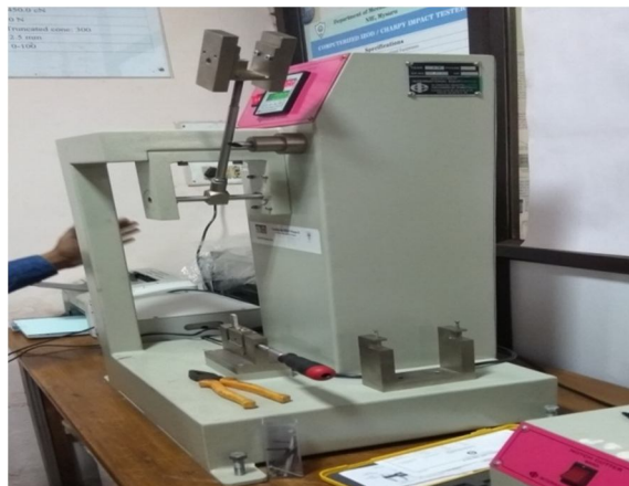
Fig 7:Izod impact test experimental setup

Impact strength is the capability of the material to withstand a suddenly applied load and is expressed in terms of energy. The specimens of size 55 mm x 10 mm x 4 mm were tested.