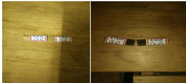
Fig 8: Hardness test specimen

Hardness is the capability of the material to resist deformation due to indentation loading. The hardness of the composite is determined by use of a Rockwell hardness tester considering the L scale, with a weight of 60kgf, using 2.5mm ball indenter.