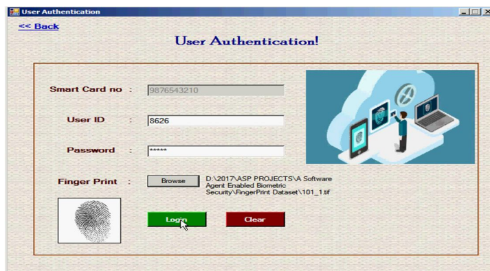
Fig 3: User Authentication