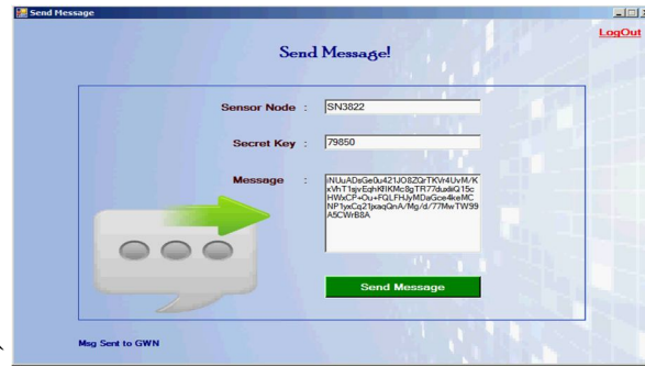
Fig 4: Send Message