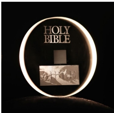
Fig 3: This is a crystal with the whole of the King James Bible stored on it.